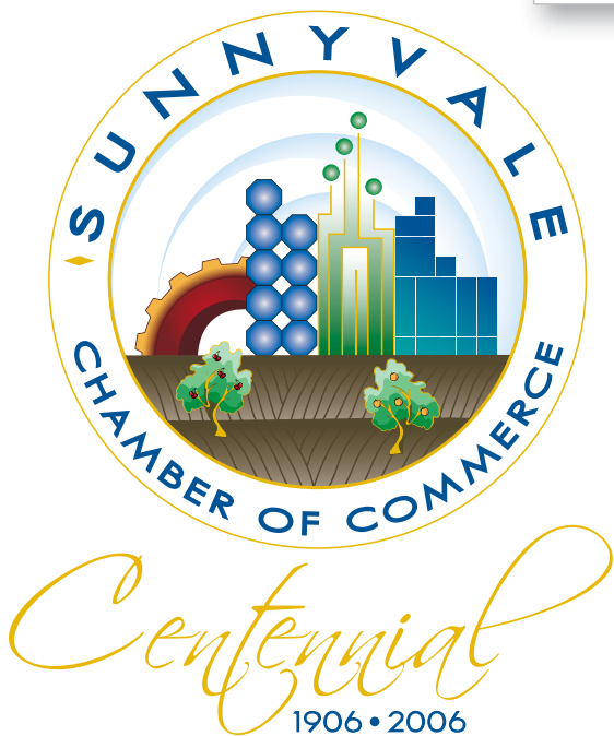
4.5 x 6.25 note card