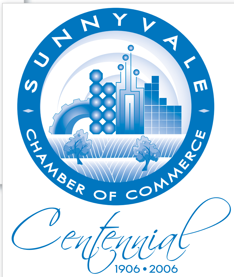
4.25 x 5 clear window decal